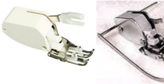
Walking foot or Even Feed Foot

-Feet for your machine -try both of these feet on your machine before class to be sure that you have the correct ones- if you don't have them, bring your machine to your dealer so that the proper foot can be