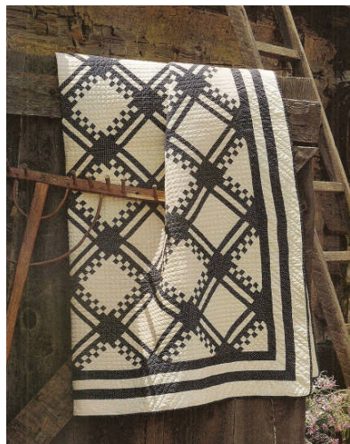
Quilt 1 – Blue/White Check