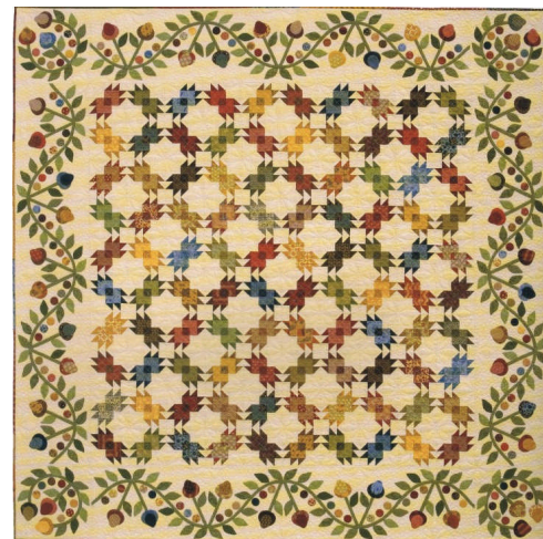
Quilt 3 – Passing Fancy with Appliqué